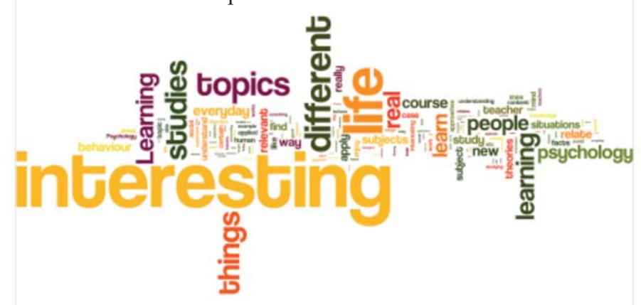
Figure A2.1: Word warp of 'the things I like BEST about my psychology course'

Respondents were also asked to respond to some open questions. Data from three of these are presented in the format of a word warp.