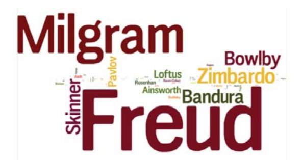
Figure A2.3: Word warp of responses to 'who do you think are the THREE most important or influential psychologists?'