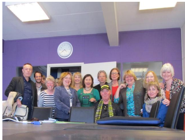
The complete EFPTA Board in good spirits – after productive committee work.